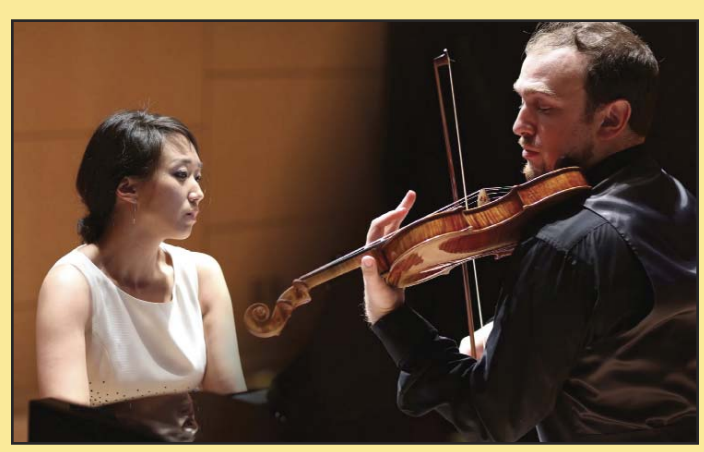
continued on page 3

"Shea and Kim work exquisitely as a team, overlapping their lines so seamlessly they become inseparable,"